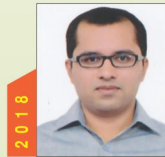
Badole Girish, IAS