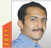
Prashant Patil, IAS