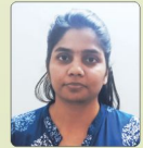
MAHALLE MAYURI All India Rank - 794 PERSONALITY TEST MENTORING PROGRAMME