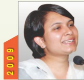
Sheetal Ugale, IAS