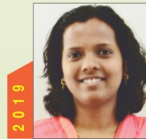
Dhodmise Trupti, IAS